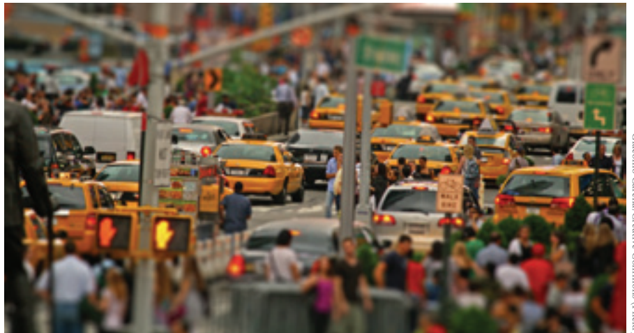
New York City and other large cities have poor air quality due to the high number of cars, trucks, and buses powered by gasoline and diesel. Clean transportation solutions are available today to help move people and goods around in a cleaner, more reliable way.

The transition to clean transportation is an opportunity to modernize our poor road and public transit infrastructure and make it more resilient. One-third