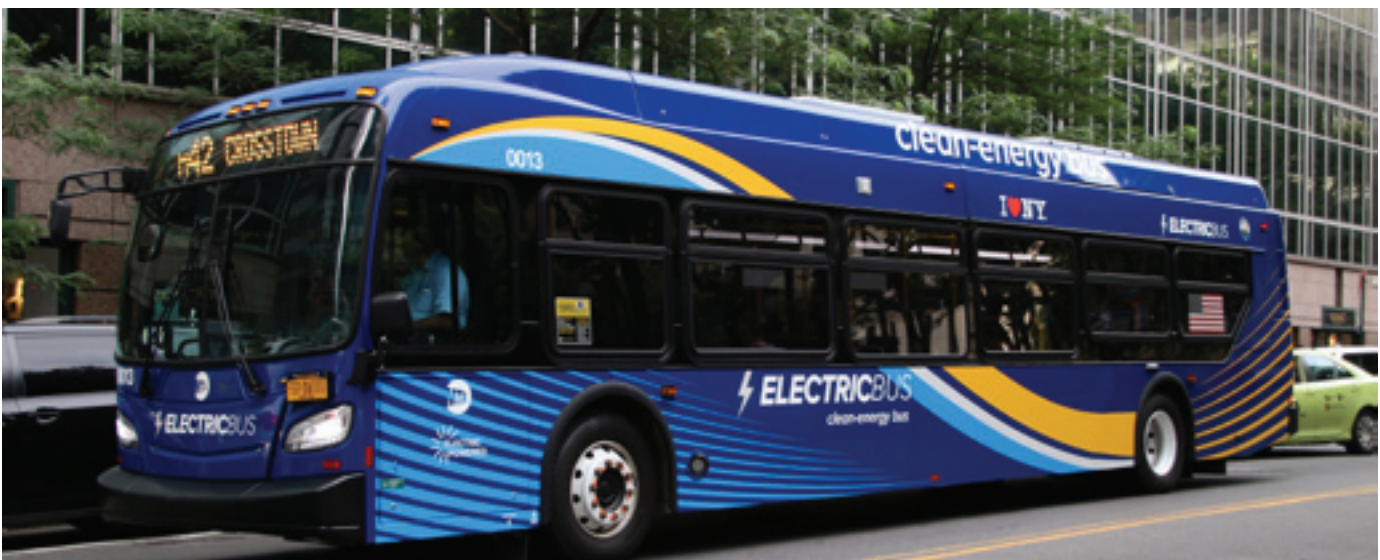
Revenue from a transportation-based cap-and-invest system could allow New York to purchase more electric buses, install EV charging stations, add sidewalks and bike lanes, and other clean transportation infrastructure.